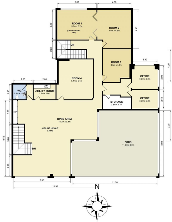
4 Daydream Street, Warriewood Measurements are approximate. Not to scale. Illustrative purposes only. Open2view does not take any responsibility for any information supplied.